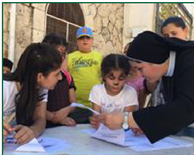
Christian educational session - Ajloun Summer Camp 2019

The children started to show passion for the church and the parish and view them as their second home, where they can spend time with their friends. Each day, there was a time for eating food all together to learn more about what sharing is caring means. The children go back home so happy, energetic and full of joy. The children enjoyed their last Friday of the camp so much because it had big inflatable games and a mini pool that filled the big yard of the church. Parents were so satisfied and thankful in their comments about the big effect this camp had made on their children's life, especially the love they had to the church and the desire of being daily present there.