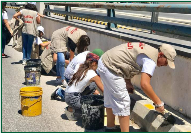
Social Activities - Fuheis Summer Camp 2019

The children and youth demonstrated the ability to grow spiritually and socially. This camp will help maintain positive relationships and life lessons that will make them stand out in the community. And as for the parents, they were glad their children got to spend their summer doing something beneficial and not waste it at home.