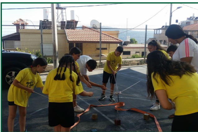
Rameh Youth Summer Camp 2019

addition, they conducted two swimming trips in different swimming pools and one sleep-over day in Mi'ilya in the Western Galilee. On the last day, the leaders organized a farewell dinner for all campers, their parents, councilors and the Parish priest: a barbeque night where gift cards have been given to the councilors, a gift for the priest and leaders, medals for all the young campers for participation and finally, a cup for the winning team.