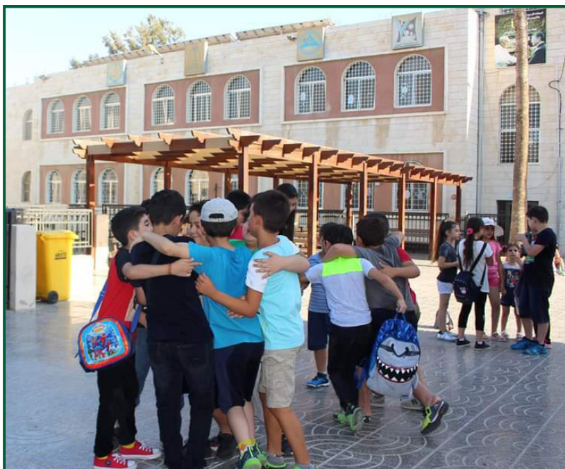
Huson Summer Camp 2019 - Jordan

The Latin Patriarchate of Jerusalem has 55 parishes in Israel, Palestine, Jordan and Cyprus. Most of the parishes conduct summer camps every year. LPJ parishes have long strived to offer fun and safe summer programs for the children and the youth. Around 7000 children and youth from different parish areas participated in the yearly summer camp of 2019. The one-month summer camp programs provide the children and the youth with the opportunity to experience and discover new or emerging interests and to focus on special skills that may be set aside or even neglected during the academic year. The summer programs allow the children to get engaged in various extracurricular activities such as drama, arts, religion, music, voluntary work, community and social services.