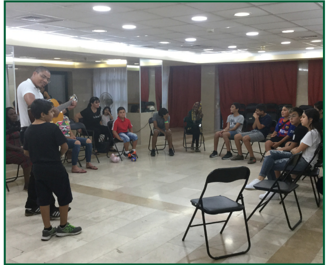
Playing the Guitar and singing Hymns