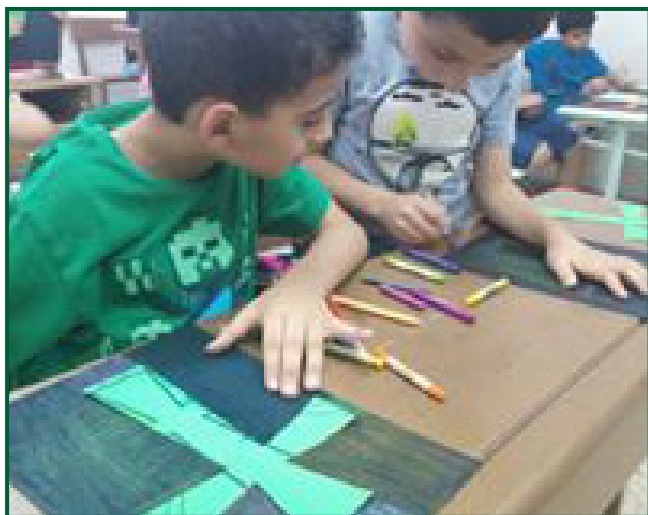
Children Making Art Works - Ajloun Summer Camp 2019

The camp had many fun and interactive activities. There were artistic sessions that included Christian drawings, painting on cardboards and on their faces, as well as plastic and woody crafts. There was group dancing sessions, watching movies and different water games with balloons and plastic cups. It also had some educational sessions proposed by nutrition and dentistry university students. Likewise, for religious Christian educational sessions.