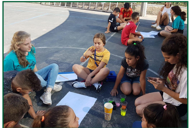
Arts Activities -Rameh Youth Summer Camp 2019

Saint Anthony Parish in Rameh conducted a summer camp for children with around 85 participants, 14 councilors and 2 leaders. It had many activities like art, educational activities, entertainment activities, Christian education, and physical activities like rock climbing and paintball game competitions between teams. Children and youth showed positive relationships and accepting the other during the camp. Campers were taken for road trips to visit Churches in many places in the north like Tiberias and the old city of Acre to learn more about the history and how their heritage is connected. Small tours around the Churches in the towns as well to teach them more about their country and why is it called the Holy Land. In