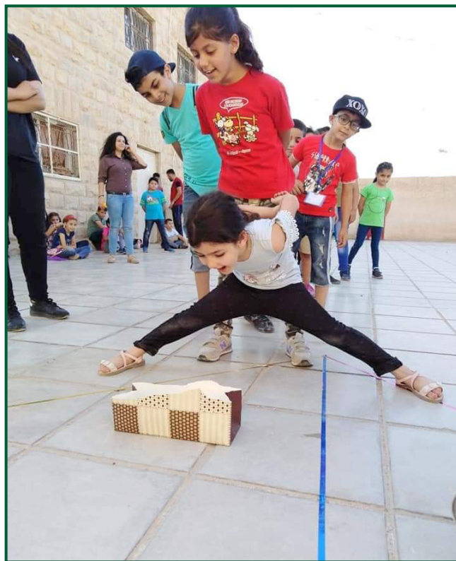
Smakieh Summer Camp 2019 - Jordan