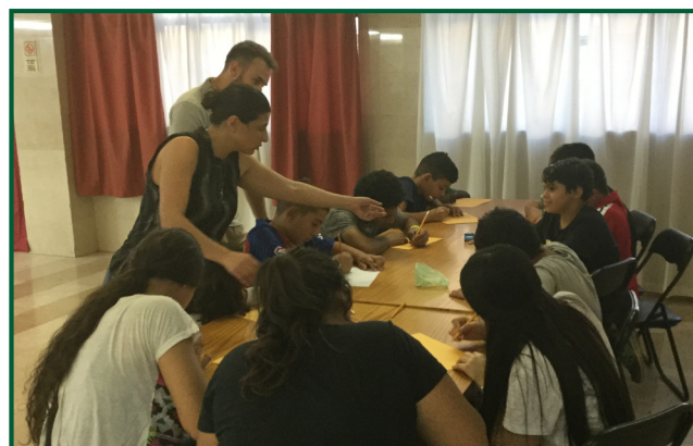
Eilat Summer Camp 2019 - Israel