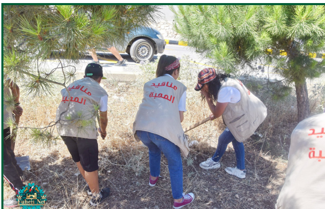
Fuheis Summer Camp 2019 - Jordan