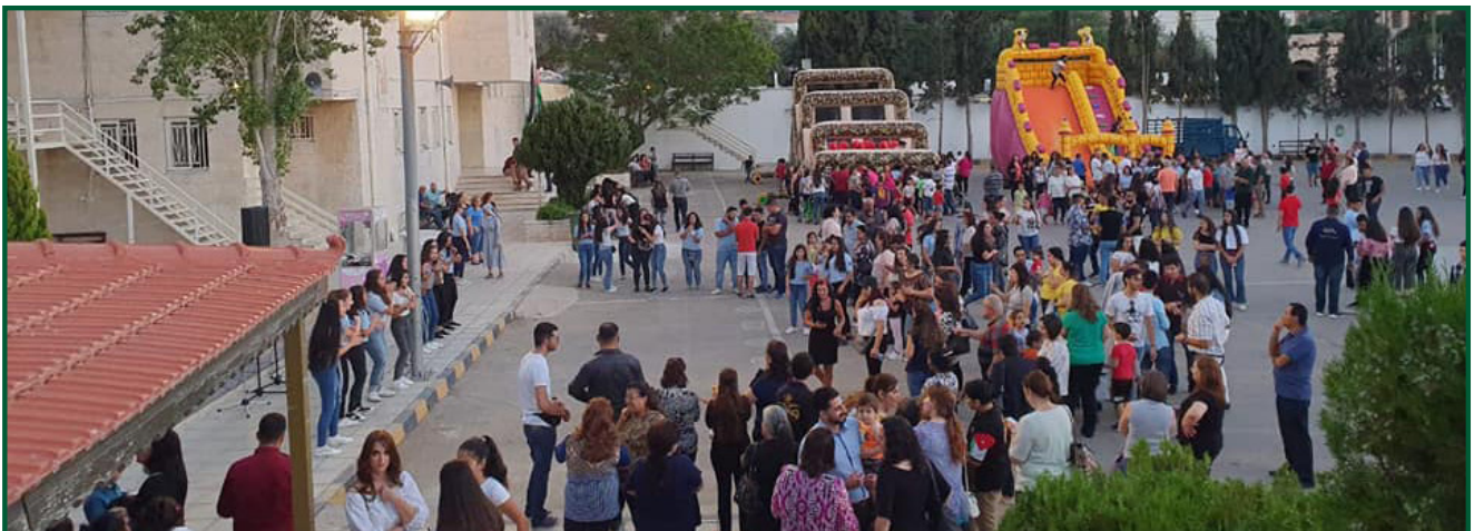
Entertainment Activity - Fuheis Children Summer Camp 2019

The Immaculate Heart of Mary parish in Fuheis organized a summer camp with traditional activities that brought around 800 young participants and 100 volunteers from all different ages. A lot of activities were done in different areas from drama training sessions to playing sports like basketball and volleyball. Watch family movies, sit and enjoy the company of friends. Spiritual, educational and recreational programs were done daily in the afternoon.