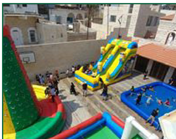
Entertaining Games in the Church Yard - Ajloun Summer Camp's Last Friday

The children started to show passion for the church and the parish and view them as their second home, where they can spend time with their friends. Each day, there was a time for eating food all together to learn more about what sharing is caring means. The children go back home so happy, energetic and full of joy. The children enjoyed their last Friday of the camp so much because it had big inflatable games and a mini pool that filled the big yard of the church. Parents were so satisfied and thankful in their comments about the big effect this camp had made on their children's life, especially the love they had to the church and the desire of being daily present there.