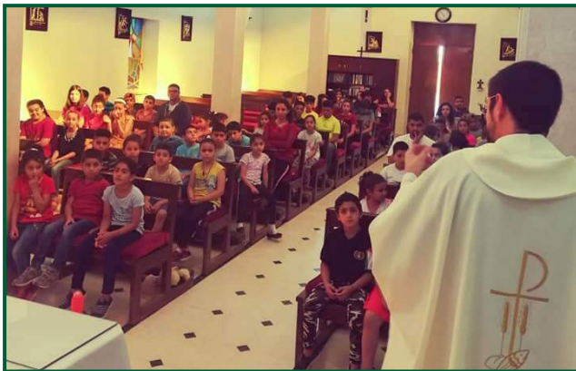
Smakieh Summer Camp 2019 - Jordan