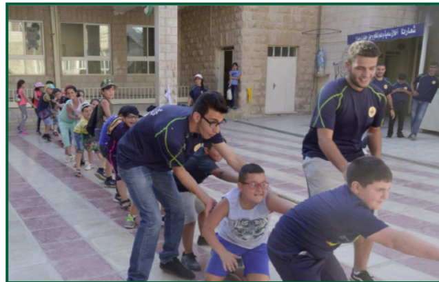
Madaba Summer Camp 2019 - Jordan