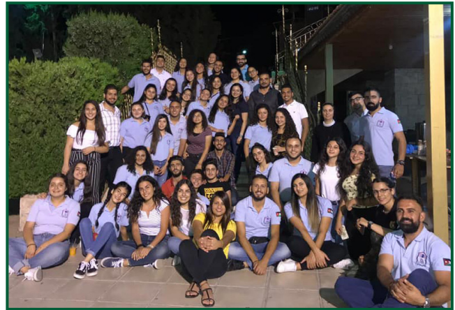
Fuheis Youth Summer Camp 2019