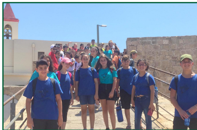
Rameh Summer Camp 2019 - Israel