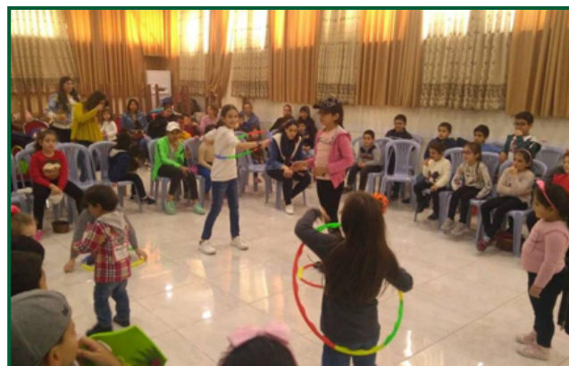
Irbid Summer Camp 2019 - Jordan