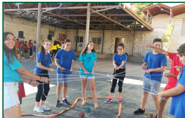
Rameh Summer Camp 2019 - Israel