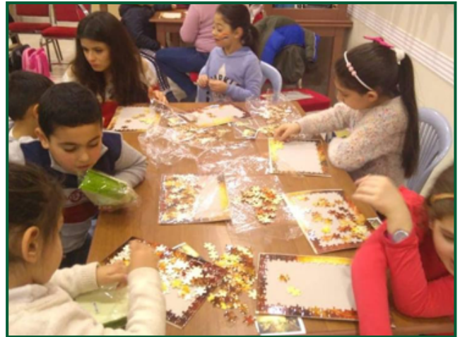
Puzzle Game Activity